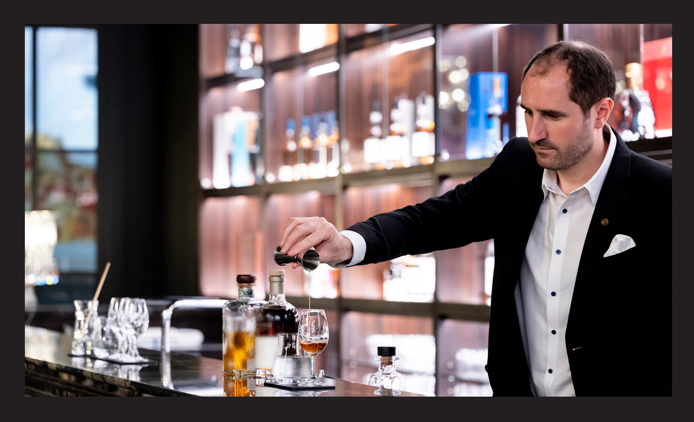
Uncover the Spirit of The Grande Whisky Museum